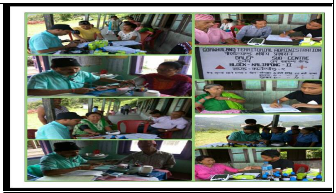
Camps conducted at Darjeeling District (WB)