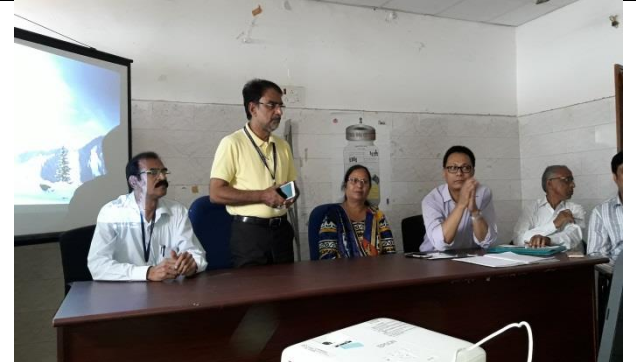
An interactive session with all the officers