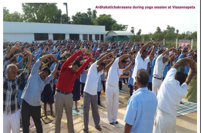
Activates undertaken on International Yoga Day, Krishna District, AP