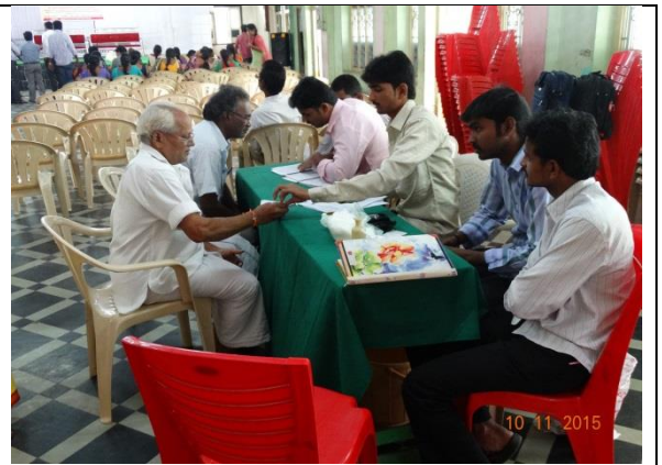
Screening of patients for diabetes